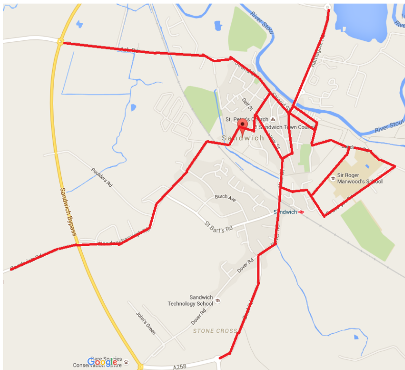
Proposed extent of a 7.5 Tonne weight restriction.

3.2 Providing there are few objections from the local community during the advertising period; installing the weight restriction can take place in the next few months. It is deemed sensible to time this with the installation of any gateways.